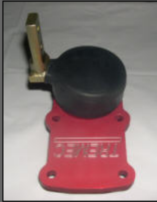
8 Optional Shifter Locations Tremec offset shifter for 500 & 600