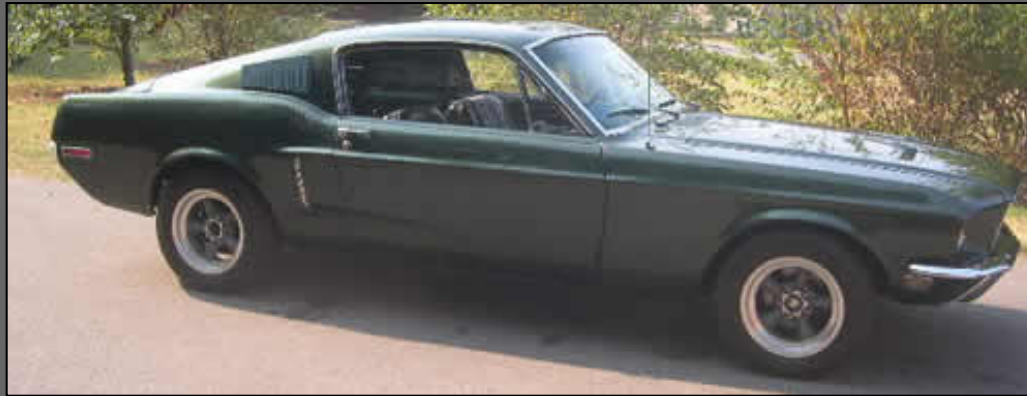
TKO 500 & 600