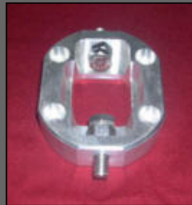
Shifter Stops, add stops to Stock Shifter